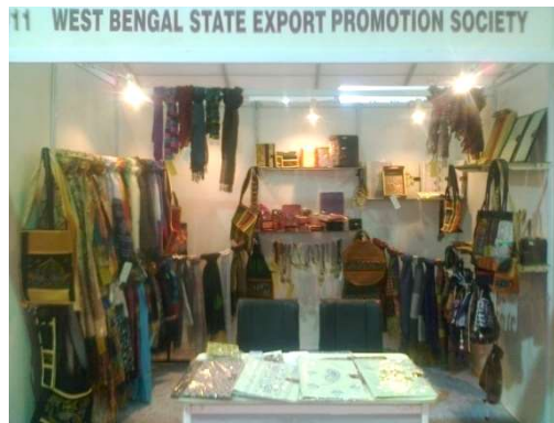
EP Society -Delhi